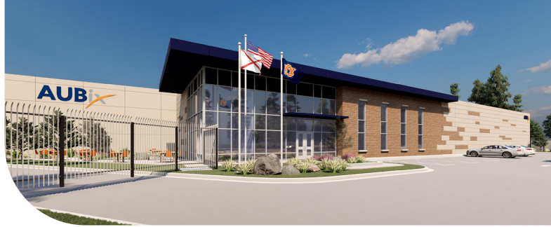
A rendering of the AUBix multi-tenant data center under construction on Samford Avenue.

AUBix will offer 22,000 square feet of available data center space and more than 3 megawatts of critical power capacity across two data halls with redundant power and cooling. The initial 40,000-square-foot buildout includes customer office space, conference rooms and tenant equipment storage.