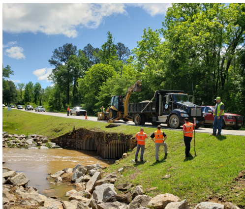
Crews work to repair a culvert after heavy rains in April.

Though the doors to City facilities have been closed since early April, your local government has continued working as hard as ever to provide the services for which you rely on us. We wanted to take a moment to extend our gratitude to our City employees who have continued to serve you, finding innovative ways to meet your needs.