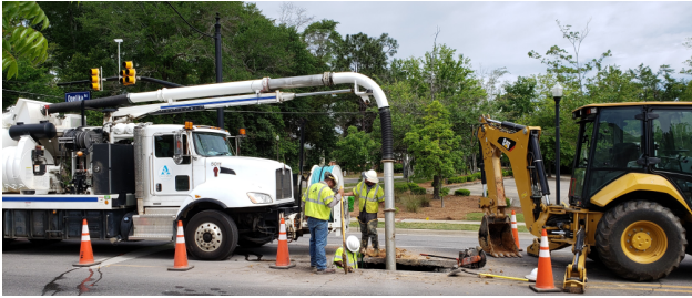
Crews repair a sanitary sewer line in April.

Each City department has continued its dedication to our one mission: providing services to you, our residents. Thanks to each of these employees for their work that allows our City to keep running in the face of whatever challenges may come.