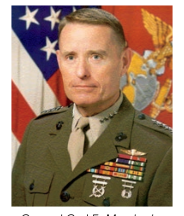
General Carl E. Mundy, Jr., USMC, 2005 Distinguished Veteran, July 16, 1935–April 3, 2014

Each Memorial Day at the Mayor's Memorial Day Breakfast, the Veteran's Committee honors a Distinguished Veteran. In 2014, two of Auburn's former Distinguished Veterans passed away. Read more about the lives and careers of these Distinguished Veterans at <a href="http://www.auburnalabama.org/veterans">http://www.auburnalabama.org/veterans</a>.