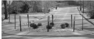
The City's newest traffic circle is located on Old Mill Road near East University Drive.