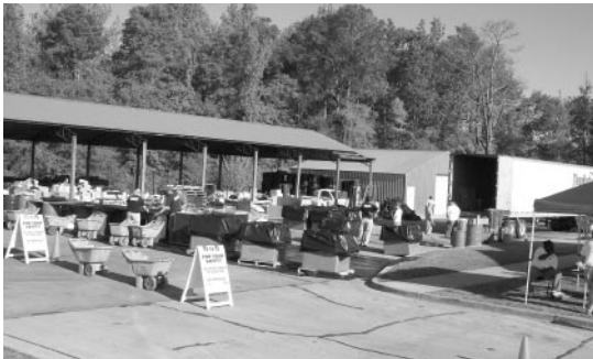
More than 250 cars dropped off materials throughout the day at the 2006 Household Hazardous Waste Day. Nearly 15,000 lbs of household hazardous waste, chemicals, and other materials were collected. The City of Auburn is one of only a select number of cities in the State of Alabama to offer a household hazardous waste collection day as an annual event for its citizens.

Household Hazardous Waste Collection Day is a rain or shine event. All City residential customers are encouraged to participate. For more information, please contact the Environmental Services Department at 501-3080.