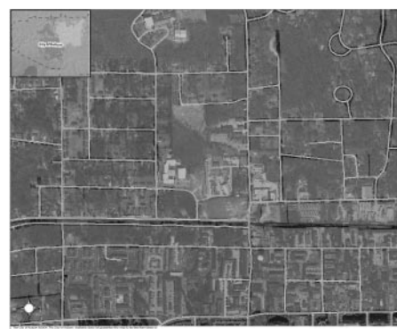
The GIS site will enable citizens to see which school their neighborhood is zoned for as demonstrated in the photo above.

The IMS has been an on-going project for the City's Information Technology Department for a number of months. The site is dynamic and will continually expand to include additional information. The Information Technology Department's GIS Division received a Special Achievement in GIS award in 2004 from ESRI, the world leader in GIS software. The award is given at ESRI's International User Conference and recognizes GIS personnel around the world for their outstanding work in the GIS field. The City of Auburn's GIS Division was one of 150 chosen from among the more than 100,000 ESRI GIS implementations