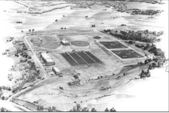
H.C. Morgan Wastewater Treatment Plant

Currently, the H.C. Morgan Wastewater Treatment Plant has a 5.4 million gallons per day (MGD) capacity. After the expansion is completed in winter 2004,