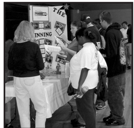
Students from Auburn High School talk to industry representatives about career opportunities in manufacturing.