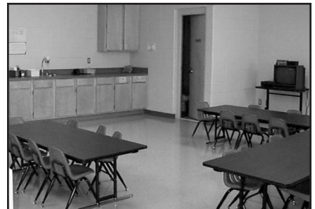
Boykin Community Center Addition

Community Development Block Grant (CDBG) funds have been utilized to expand the Boykin Community Center. The 7500 square foot addition includes seven classrooms that will greatly enhance the services this facility provides to Auburn citizens. Primarily, the addition was designed to expand programming and enable the groups in the Center to better utilize their space. Auburn Day Care and Joyland Day Care are expanding their childcare programs by moving into six of the classrooms. In addition, the project has funded the installation of a fiber-optic cable network that will allow the Boys and Girls Club of Greater Lee County to use one of the rooms as a computer lab. Children will have the opportunity to learn computer skills and gain access to the Internet. This facility continues to be enhanced to meet the needs of citizens by providing important educational and quality of life services to many Auburn residents.