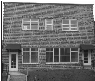
City Hall Annex