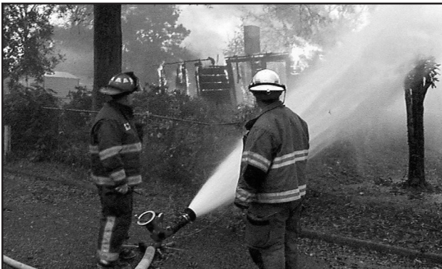
The regional training approach allows improved fire training in East Alabama.

The Regional Training Consortium is an on-going program and significant savings have been realized. This regional program has helped Auburn and other member cities defray the cost of fire training and development.