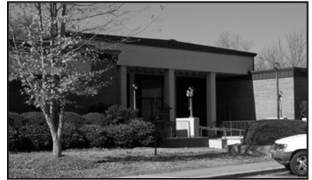
Development Services Building

The Planning Department, Water Board Revenue Office, and Engineering Division of the Public Works Department occupy the building located at 171 North Ross Street. The Codes Enforcement Division of the Public Safety Department will move into the Development Services Building in March. Parts of this building were vacated when City Hall moved to its Tichenor Avenue location. This building, now serving as the Development Services Building, houses the development-related service functions of the City. The hours of operation for these services is 7:30 a.m. until 4:30 p.m. The Water Board Revenue office drive-through remains open until 5:00 p.m.