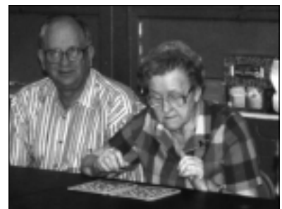
Seniors enjoy special programs and activities.

Auburn Day Care Centers: provides services for low-and moderate-income children from 6 weeks to 12 years old.