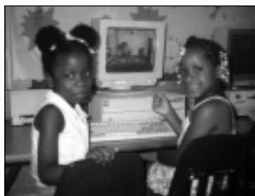
Community children have access to computers.

In October 1993, a groundbreaking ceremony was held for the new Boykin Community Center Gymnasium. The addition of the gymnasium was a joint effort by the City of Auburn and the Auburn Housing Authority and provides space for indoor recreational activities and meeting room space.