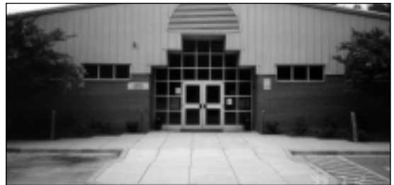
Boykin Community Center Gymnasium

During the summer of 1983, the Auburn City Schools vacated Boykin School. The City Manager proposed leasing the facility from the Auburn City Schools in order to house a number of non-profit and community-based groups that could serve residents of the area. Several groups expressed an interest in occupying available space in the building. In September of that year, the Auburn City Schools signed a lease on the building with the City. On November 28, 1984 the City held an Open House to introduce the citizens to the "Boykin Community Center" and its new tenants.